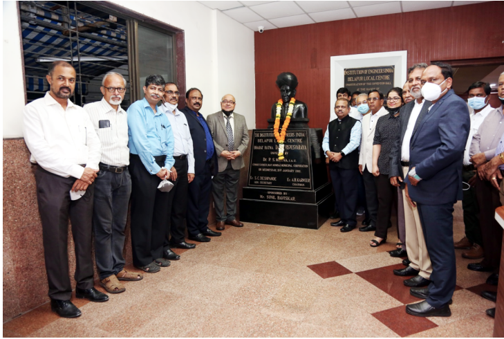
Garlanding of Sir M. Visvesvaraya statue